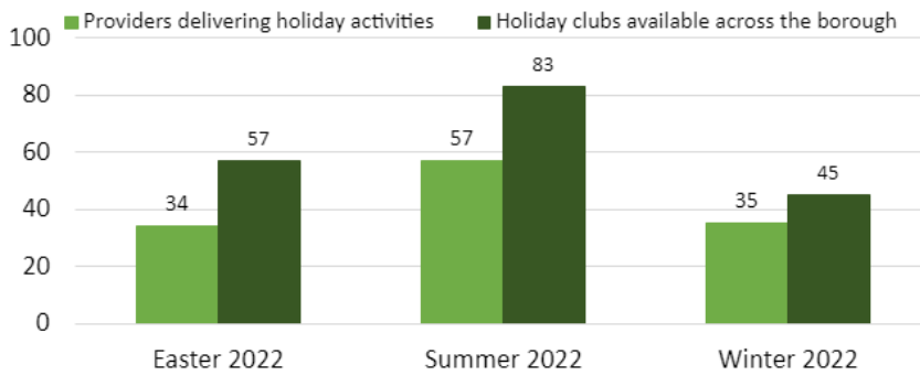
Breakdown of HAF Provision in Cheshire West & Chester 2022

“Today was boss because we got muddy, I made new friends and football was fun”